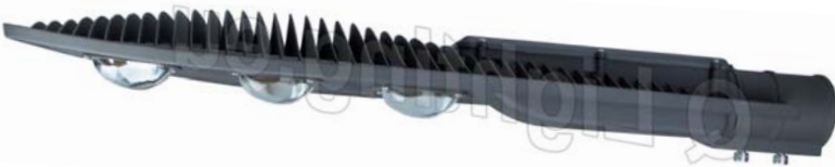
Luminaire light beam spread