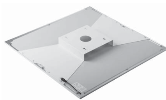
bracket for surface mounting